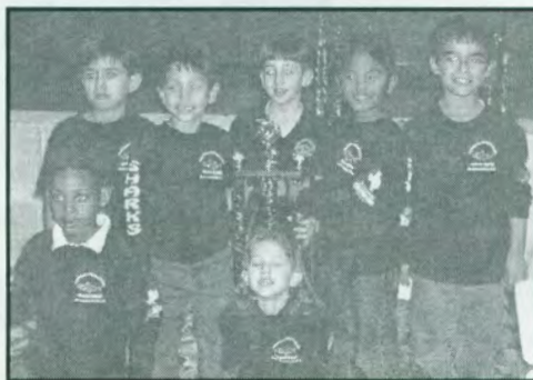
Primary Championship Team Paredes Elementary, Brownsville