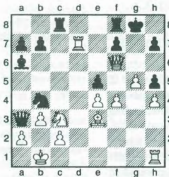
8. White to move Anand-Mestel, London 1985