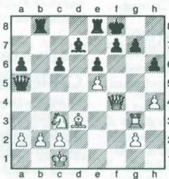
5. White to move Keres-Szabo, Budapest 1955