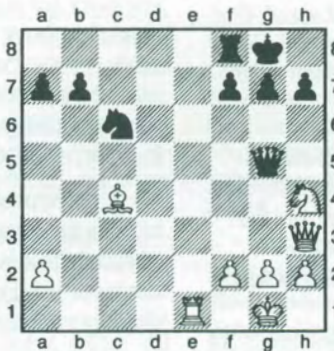
2. White to move Andersen-Neumann, Berlin 1860