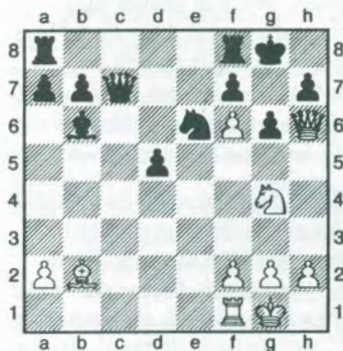
1. White to move Bird-Pinkerley, London 1850

Positions from Joel Johnson, Formation Attacks . Solutions: p. 5