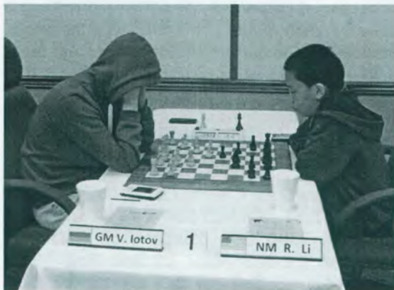
2013 Champion vs. Future Champion?

Be6 24.Qxf4 Rac8 25.Kb1 Qe7 26.Rd4 d5 27.exd5 ½-½