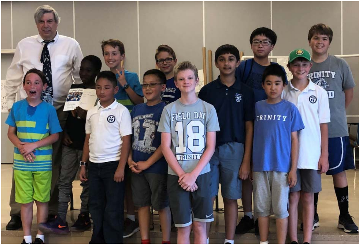
Region IX Team Champion, Trinity School of Midland