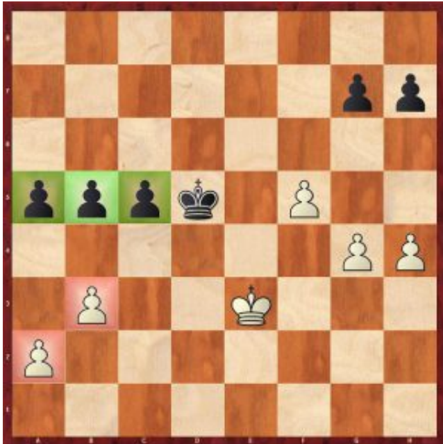
Premkumar (2048) – NM Toolin (2323) 8/6pp/8/pppk1P2/6PP/1P2K3/P7/8 b